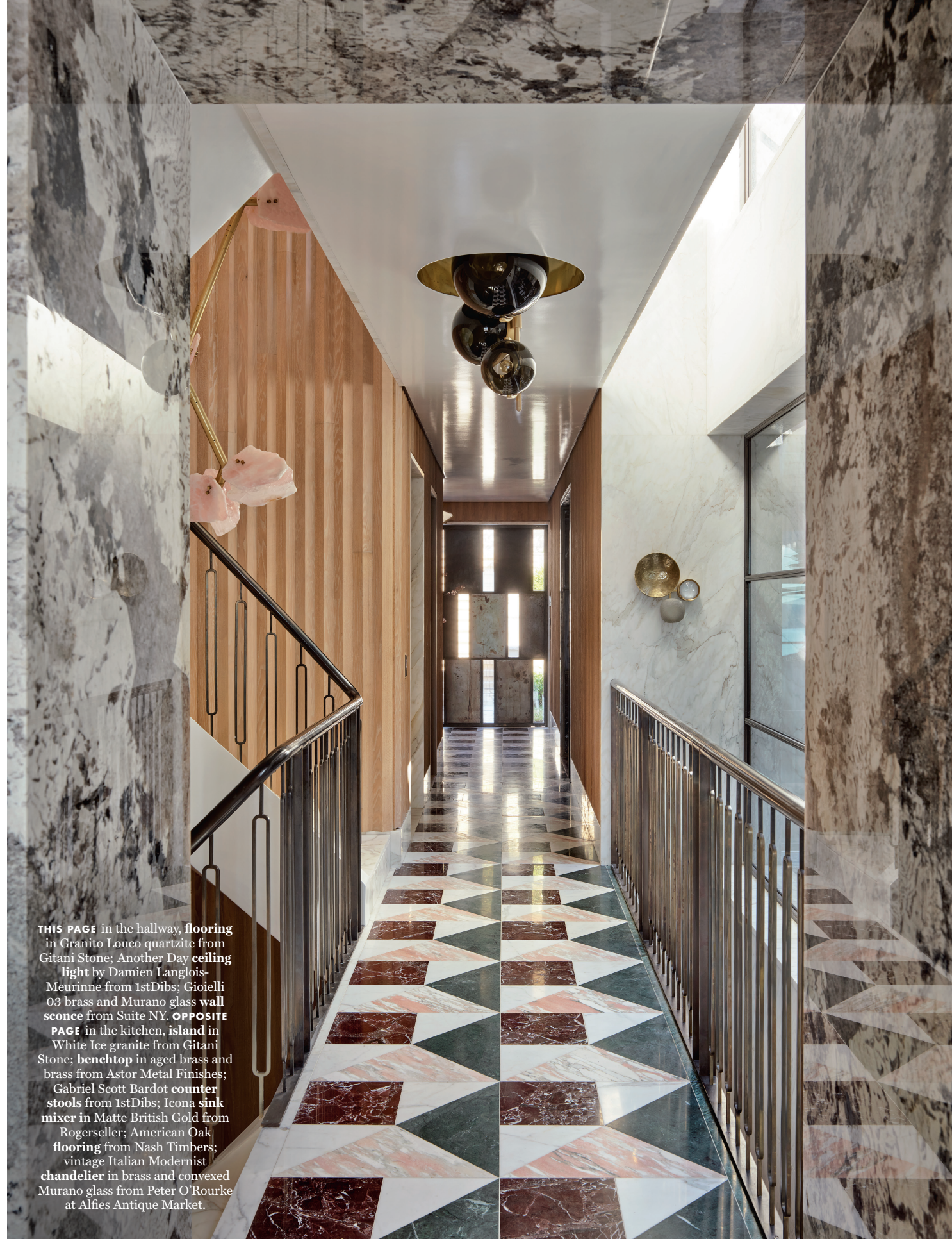
THIS PAGE in the hallway, flooring in Granito Louco quartzite from Gitani Stone; Another Day ceiling light by Damien Langlois-Meurinne from 1stDibs; Gioielli 03 brass and Murano glass wall sconce from Suite NY. OPPOSITE PAGE in the kitchen, island in White Ice granite from Gitani Stone; benchtop in aged brass and brass from Astor Metal Finishes; Gabriel Scott Bardot counter stools from 1stDibs; Icona sink mixer in Matte British Gold from Rogerseller; American Oak flooring from Nash Timbers; vintage Italian Modernist chandelier in brass and convexed Murano glass from Peter O'Rourke at Alfies Antique Market.